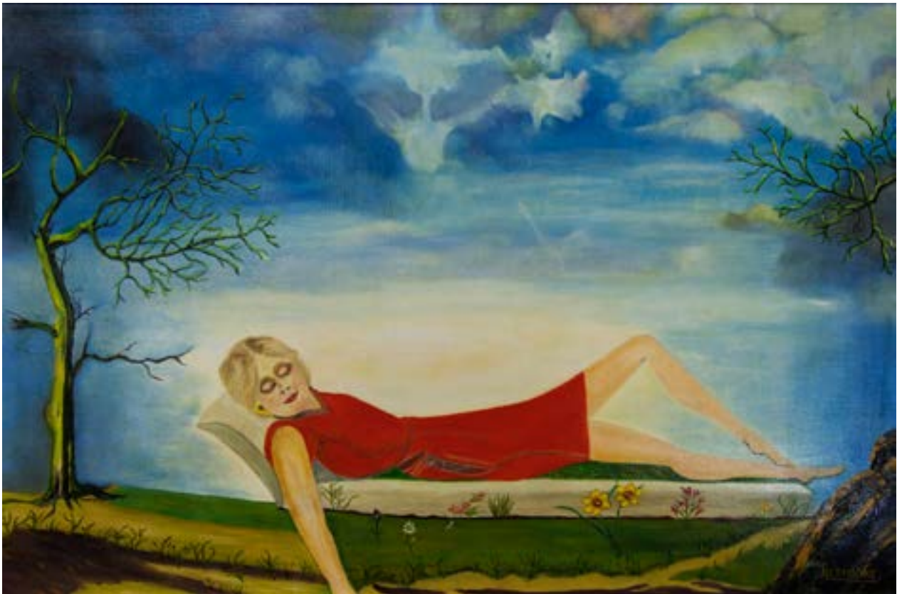
Hermione Burton, Pleasant Thoughts/ Jacqui on a Plinth (1993), 105.5 x 75 x 5.5cm