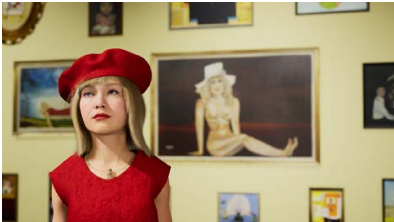
Andy Holden Still from Hermione: Kingdom of the Sick (2022)

Holden curated Beano: The Art of Breaking the Rules at Somerset House in 2021 and has previously curated World as Cartoon at Tate Britain (2017) and Be Glad for the Song has No End at Wysing Arts Centre (2010). In 2021 a book of interviews with Holden was published by Slimvolume under the title Collected Free Labour . His work is in the permanent collections of Tate, Arts Council Collection, Bristol Museum & Art Gallery and Leeds Art Gallery and numerous public and private collections in Europe. His work was recently included in British Art Show 9.