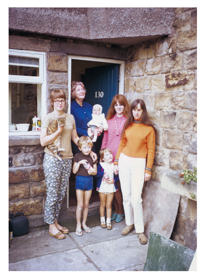
Hugh Hoyland, Family Group (Sheffield 1969) Vintage Ektachrome slides on Maxima c-type print, Edition of 50