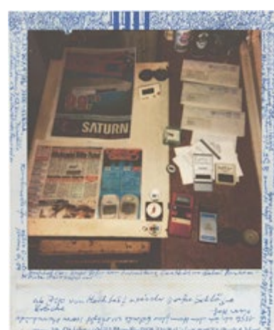
Horst Ademeit untitled 11 x 9 cm / 4¼ x 3½ in