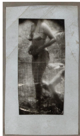
Miroslav Tichý untitled (2004) 25 x 14 cm / 9¾ x 5½ in