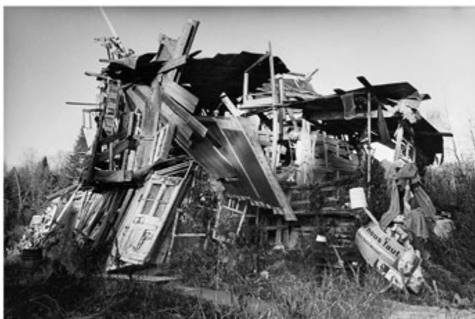
Mario del Curto / Richard Greaves untitled (2017) 40 x 60 cm / 15¾ x 23½ in