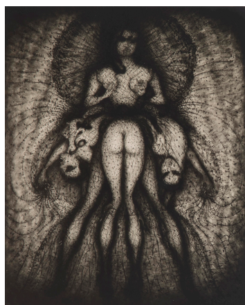
Pierre Molinier untitled (1966) 19.7 x 15.9 cm / 7¾ x 6¼ in