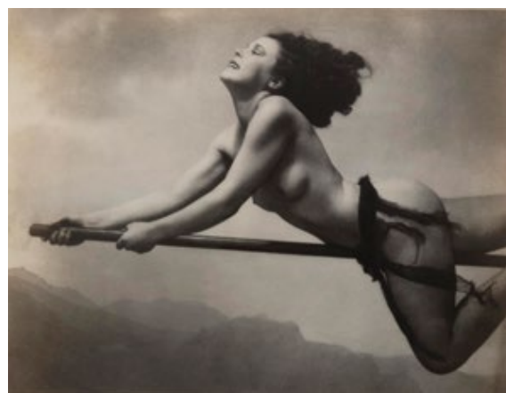
William Mortensen untitled (Myrdith on Broom) (c 1930) 14.6 x 16.5 cm / 5¾ x 6½ in