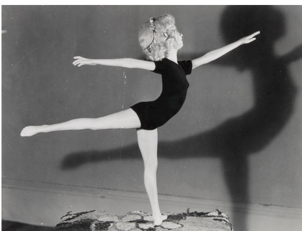
Morton Bartlett untitled (c1950) 10 x 13 cm / 4 x 5¼ in