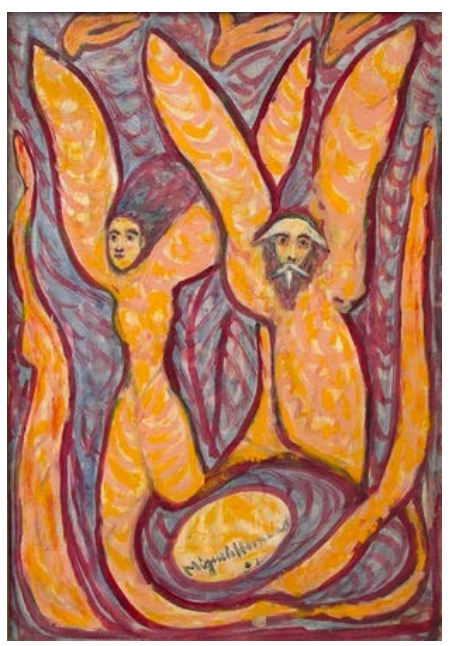
Miguel Hernández, untitled, 1951 oil on canvas 55 x 38 cm / 21 5/8 x 15 in