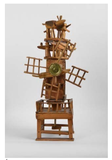
Émile Ratier, untitled, c 1950s wood, tin, nail, metal, wire 99 x 50 x 44 cm / 39 x 19 3/4 x 17 3/8 in