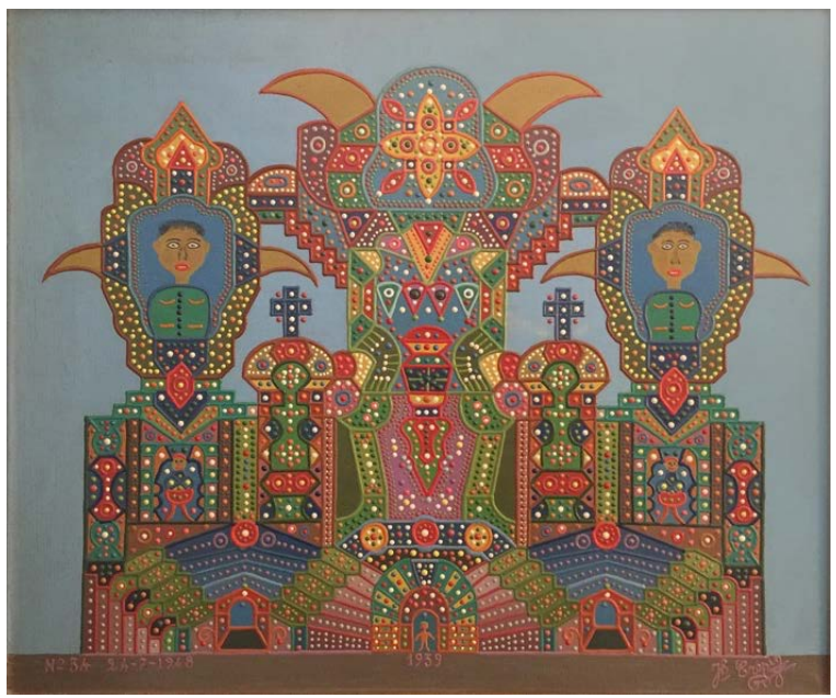
Fleury-Joseph Crépin oil on canvas 57 x 67 cm / 22 1/2 x 26 3/8 in