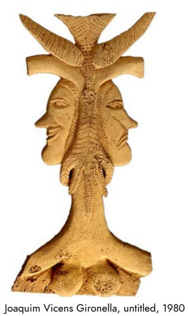
cork 75 x 36 x 6 cm / 29 1/2 x 14 1/8 x 2 3/8 in