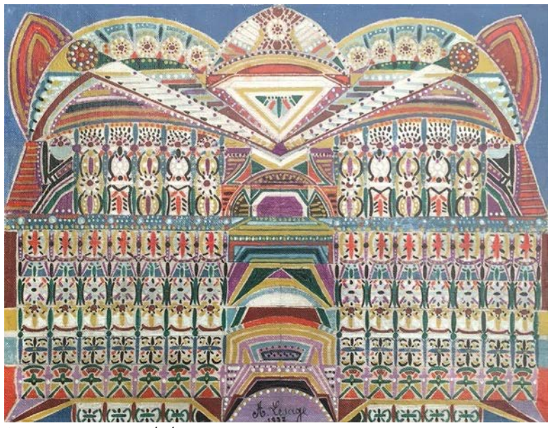
Augustin Lesage, untitled, 1927 oil on canvas 29 x 38 cm / 11 3/8 x 15 in