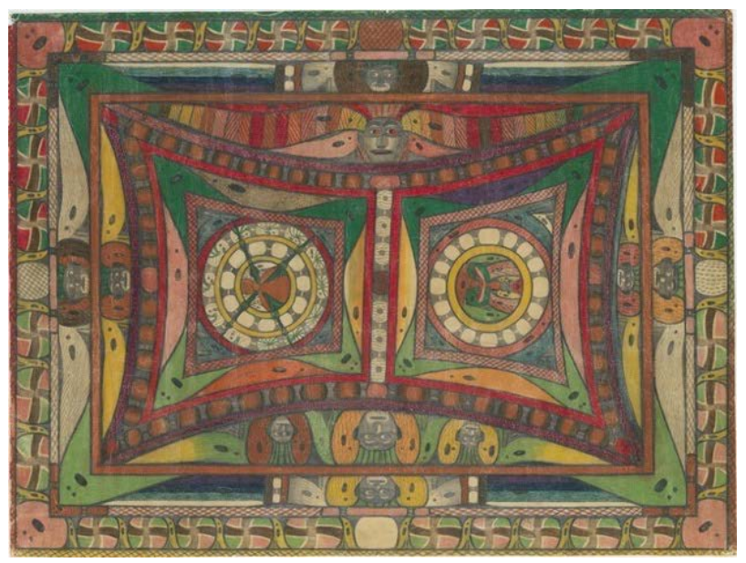
Adolf Wölfli, untitled (St. Adolf...) , c 1922/25 crayon, coloured pencil, pencil on paper 50.5 x 67 cm / 19 7/8 x 26 3/8 in