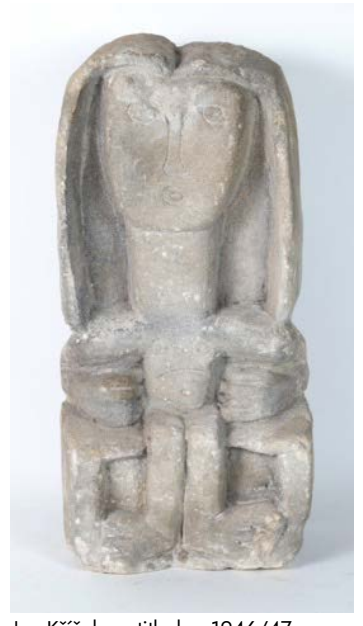
Jan Křížek, untitled, c 1946/47 sandstone 39 x 19 x 15 cm / 15 3/8 x 7 1/2 x 5 7/8 in